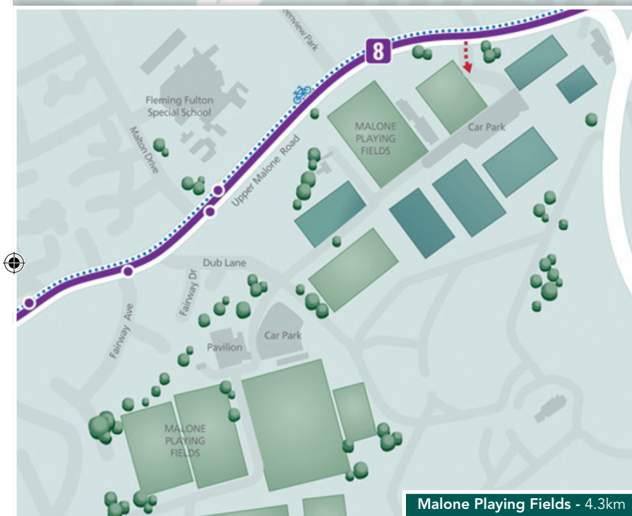
Malone Playing Fields - 4.3km