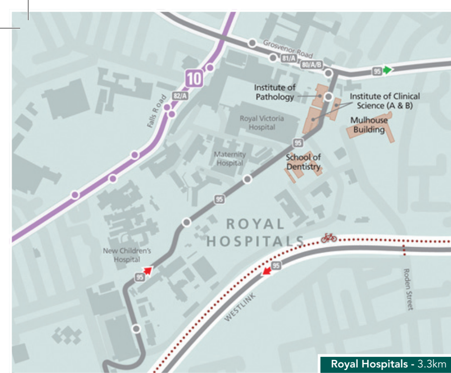
Royal Hospitals - 3.3km