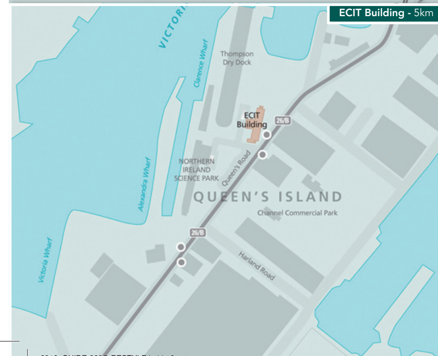
ECIT Building - 5km